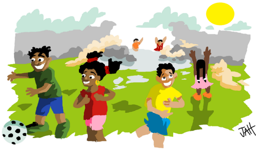
"Breaking Down The Wall" by JAH